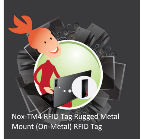
Nox-TM4 RFID Tag Rugged Metal Mount (On-Metal) RFID Tag